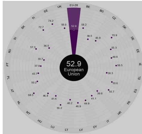
Figure 1. EIGE-Gender Equality Index, 2014 2

slightly below 53, meaning that, on average, gender equality in the EU is only halfway achieved. To anyone caring about such equality, this is bad news. To anyone caring about Europe's future, this is bad news, too. To anyone carrying for Romania this is even worse - as Romania is on the last position among all 27 EU countries.