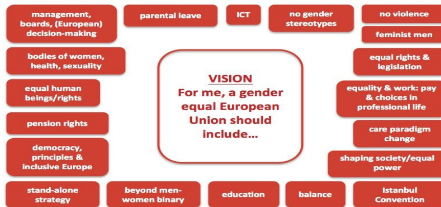
Figure 4 GM vision

A gender mainstreamed agenda could look similar with the one presented in the figure below. It should be a holistic perspective within which gender issues should be present at all levels of public and private life.